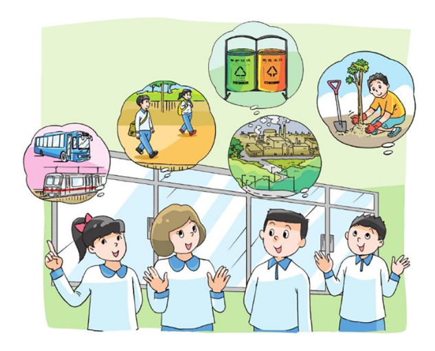
Figure 5. An excerpt from English 6 (Yilin) (Vol. 1) (He et al., 2013, p. 59)