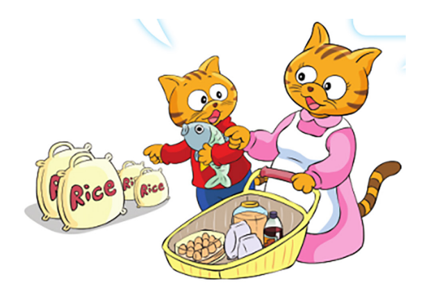
Figure 3. An excerpt from English 6 (Yilin) (Vol. 2) (He et al., 2014, p. 33)