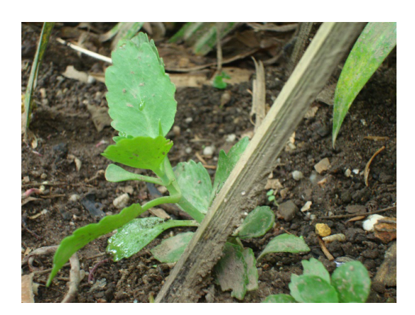
Figure 1. Si Dingin (young plant) (Bot. Bryophyllum pinnatum )

Some diseases are more widespread than others. Yet, it must be differentiated between medical disorders of "supernatural" or "natural" origin. Furthermore, some diseases are considered to be not life-threatening, like worms or toothache, while others are severe, like Malaria. The authors chose the well-known plant Si Dingin as exemplary (as shown in Figure 1).