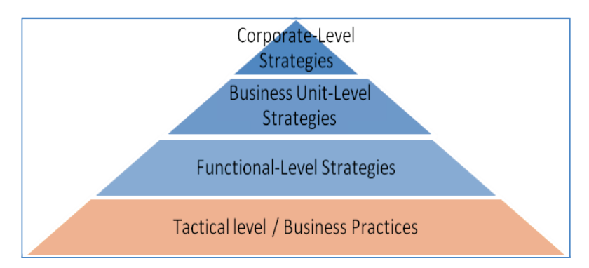
Figure 1. Hierarchical levels of strategy

according to organisation levels, portrayed in Figure 1. The lower layer of strategies is derived from the broader strategies of upper levels. The level of detail increases, and the planning time frame decreases from the top to the bottom of the hierarchical levels (Pearce II & Robinson, 2009).